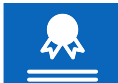
Calibration Certificate Service